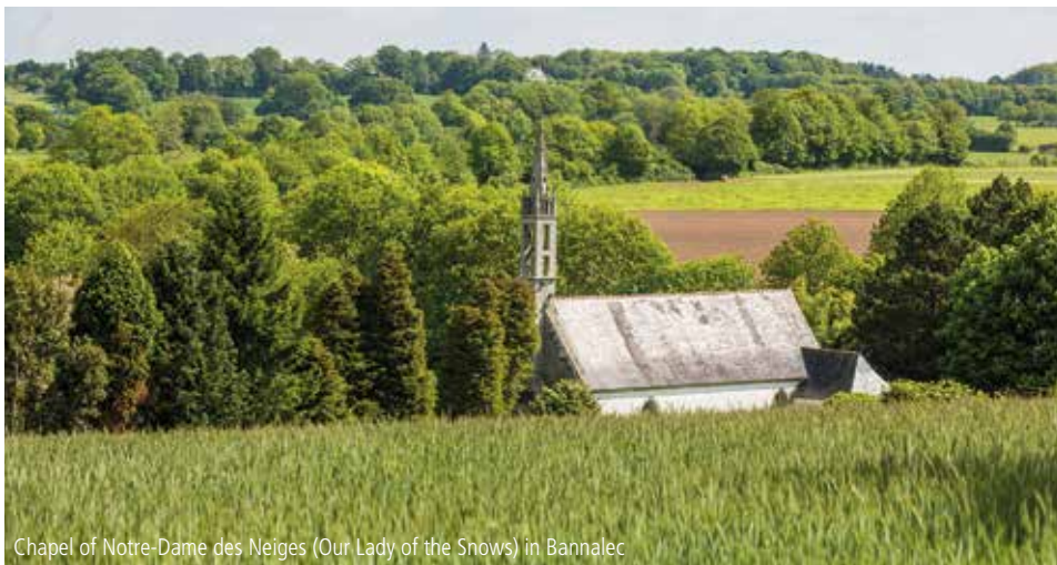
Chapel of Notre-Dame des Neiges (Our Lady of the Snows) in Bannalec

With its rich, remarkable and diverse heritage, the municipalities of Bannalec and Saint-Thurien seduce lovers of history and hiking. Nestled in the heart of green valleys, Chapels and oratories are unveiled along the way in areas where nature is Queen. Dolmens and allées couvertes (covered enclosures) are testimony of this wealthy past.