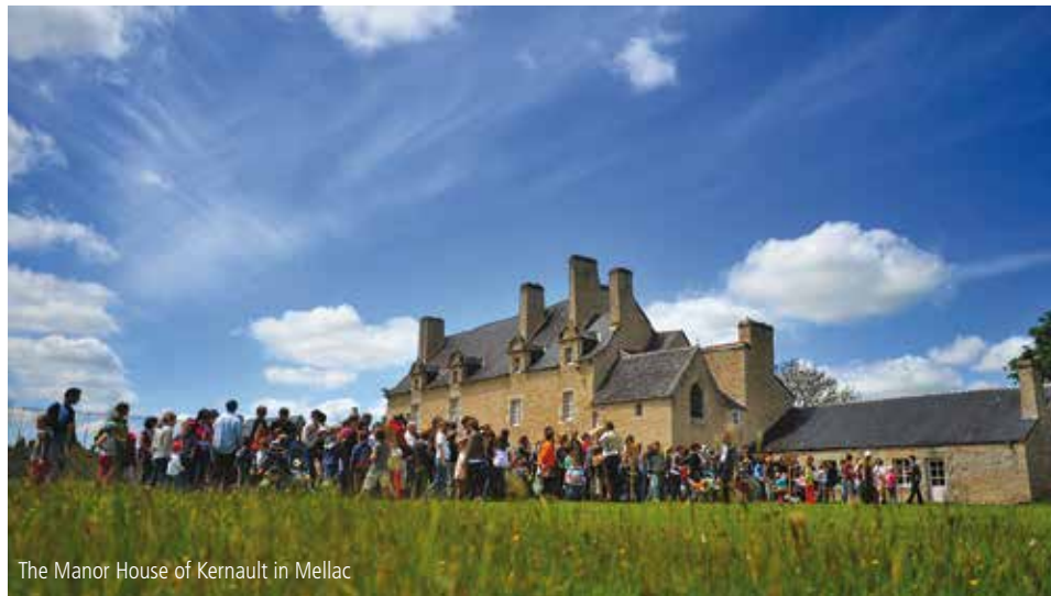
The Manoir House of Kernault in Mellac

These three communes at the gates of Quimperlé contain an iconic Breton heritage, which includes Kernault Manor House. Lovers of architecture, history and refinement, will want to visit Mellac, Baye and Le Trévoux.