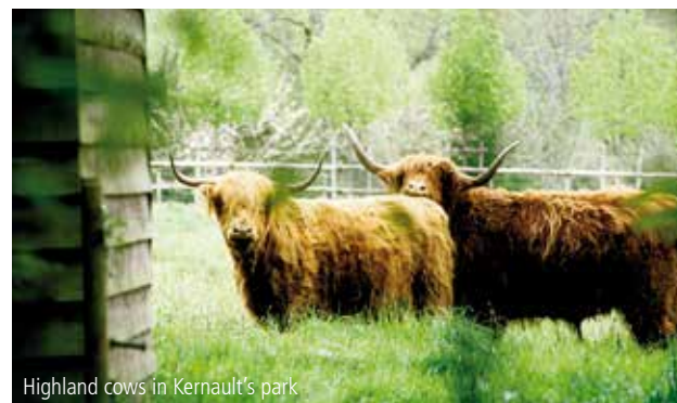
Highland cows in Kernault's park

Located near the village and set in an alcove, this 19 th century fountain is surrounded by a masonry wall and topped by a cross. It is dedicated to Saint-Eloi and to Saint-Cornély the protector of cattle. During a procession, the animals were blessed as they passed the fountain.