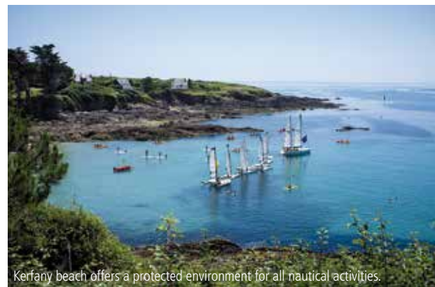
Kerfany beach offers a protected environment for all nautical activities.

Starting point of several hiking trips, this port is also a not-to-be-missed stopover for gourmets. It is here that the famous Bélon flat oyster called "la Bélon" is bred, between salted water and fresh water and discover the panoramic view over the ria !