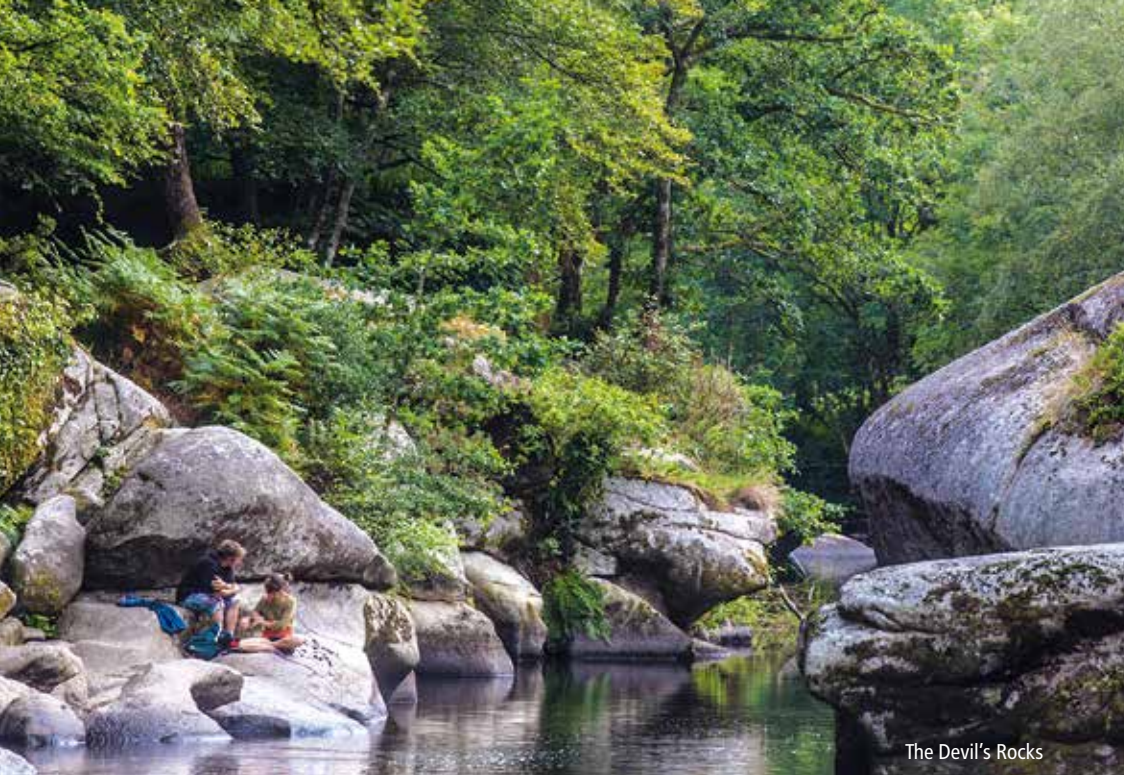
The Devil's Rocks