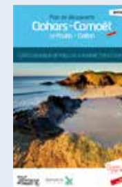
The touristic map of Clohars-Carnoët is available from all our Tourist Offices.