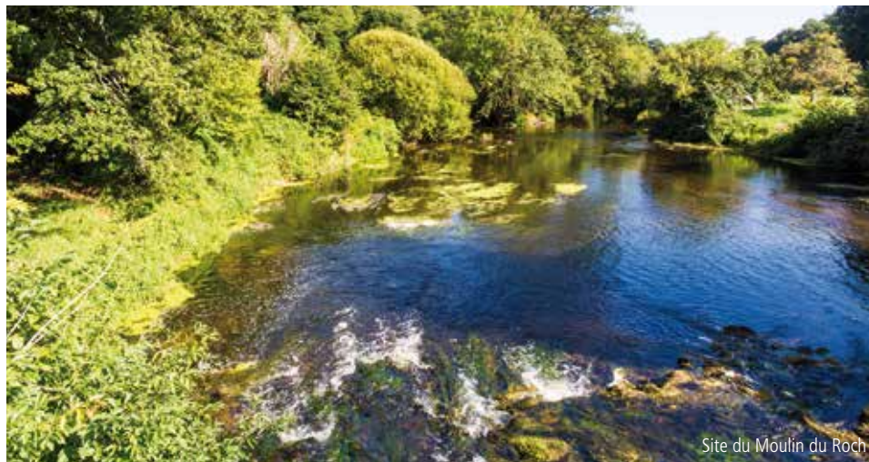
Site du Moulin du Roch

On the east of Quimperlé, 3 rural towns where hills and landscapes of farmland intermingle await your visit. This green setting offers lovers of nature a variety of walks in preserved surroundings, and offers fishermen inescapable sites for their enjoyment. Several heritage sites are worth the detour from a historical and architectural point of view.