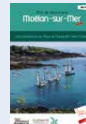
The touristic map of Moëlan-sur-Mer is available from all our Tourist Offices.