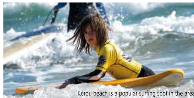
Kérou beach is a popular surfing spot in the area.

This windmill dated 16th century is the last operational windmill in Finistère. Restored by an association with stones of old surrounding houses, its complete mechanism allows it to grind since 1994. Visits are possible in July and August, with an exhibition dedicated to harvesting.