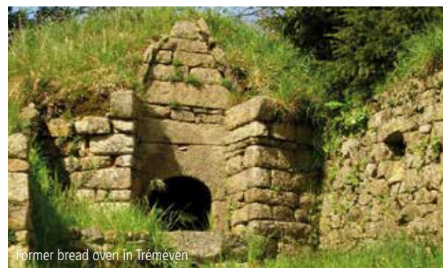
Former bread oven in Tréméven

Located near a headstone, the fountain is home to a statue of Saint Diboan portrayed in a Bishop's outfit. The statue was added at some later stage. The water drains to a nearby washhouse. At the bottom of the basin is a hole that is the object of an ancient practice. People looking to be wed used to put a pin on the surface of the water and if it sank straight into the cavity, it meant they would definitely get wed within the year.