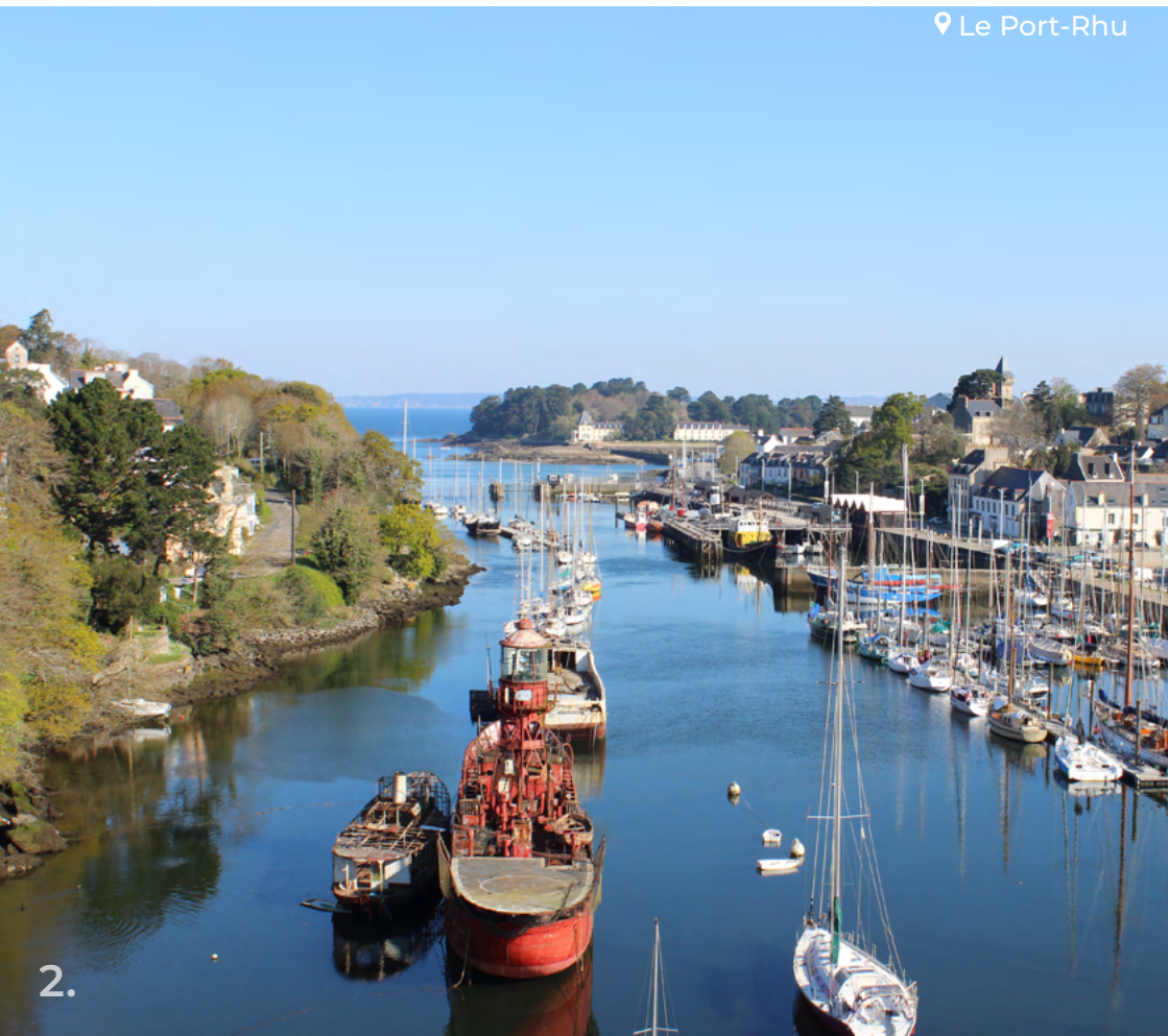
📍 Le Port-Rhu

3 The marina in Tréboul plays host to various nautical events every year. This stopover port is also the starting point for a beautiful coastal walk with unbeatable views over the island of Île Tristan.