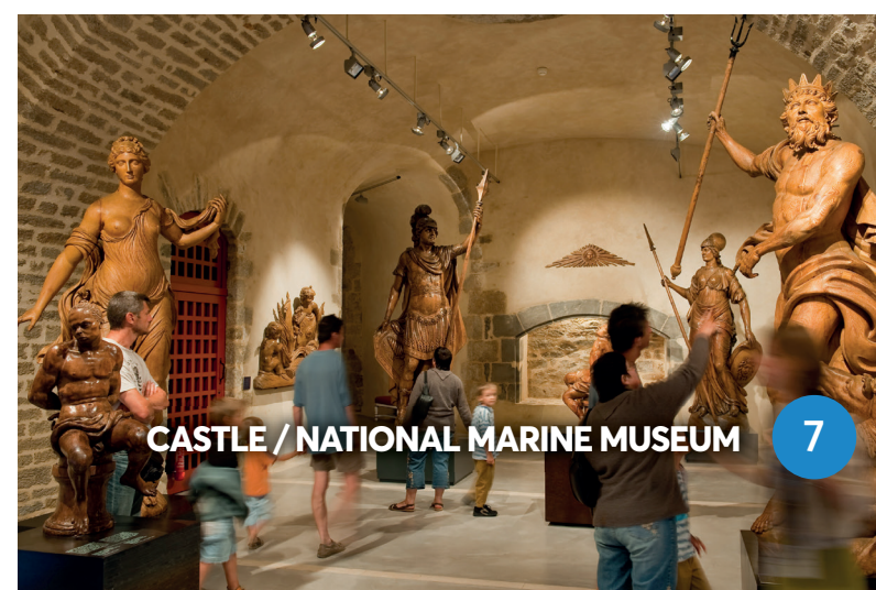
CASTLE / NATIONAL MARINE MUSEUM 7