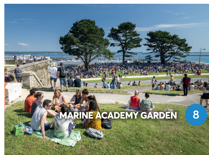
MARINE ACADEMY GARDEN 8