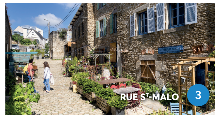
RUE S'-MALO 3