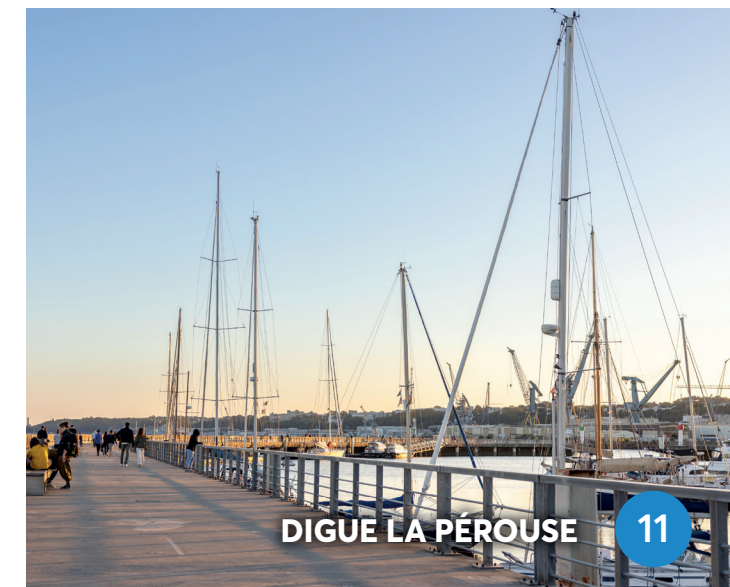
DIGUE LA PÉROUSE 11

OFFICE DE TOURISME ET DES CONGRÈS BREST métropole FROM SEPTEMBER TO JUNE Monday to Saturday : 9:30 - 18:00 On Tuesday : 10:00 - 18:00 On Saturday : 10:00 - 13:00 On Sunday : 10:00 - 17:00 Closed on Sunday, 01/05, 01/11 and 11/11, 25/12 and 01/01 JULY AND AUGUST Monday to Saturday : 9:30 - 19:00 On 15/08 : 9:30 - 19:00 From 12 to 17/07 Every day : 9:00 - 20:00 THE MARITIME FESTIVAL