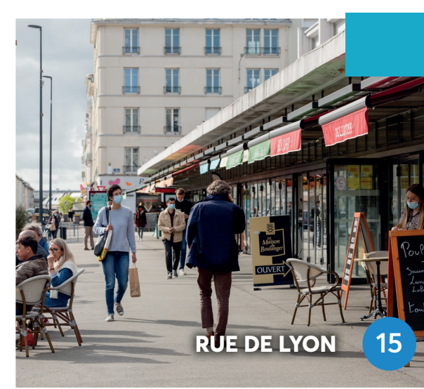
RUE DE LYON 15