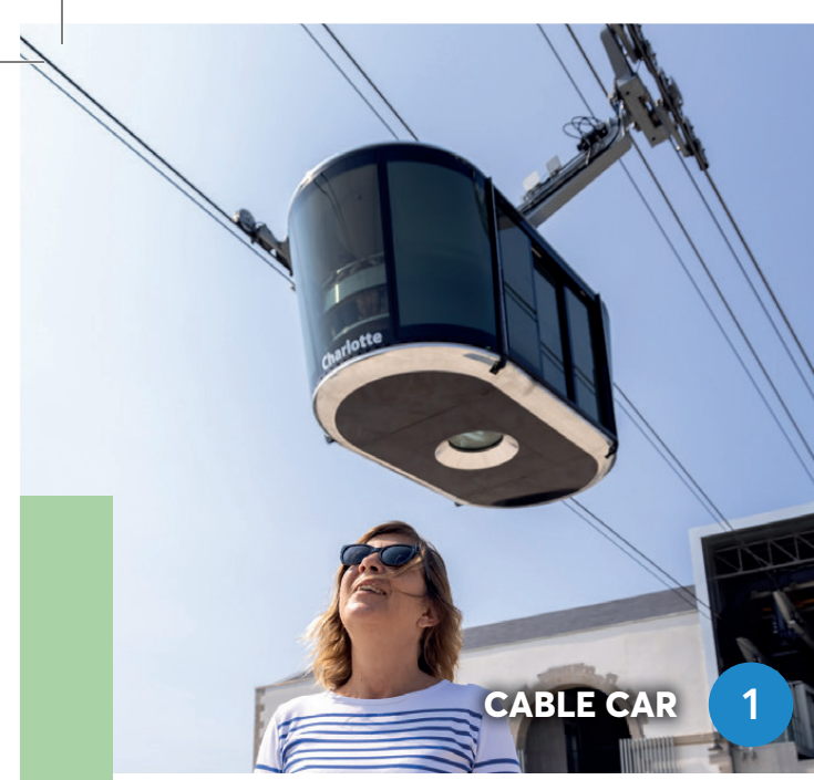
CABLE CAR 1