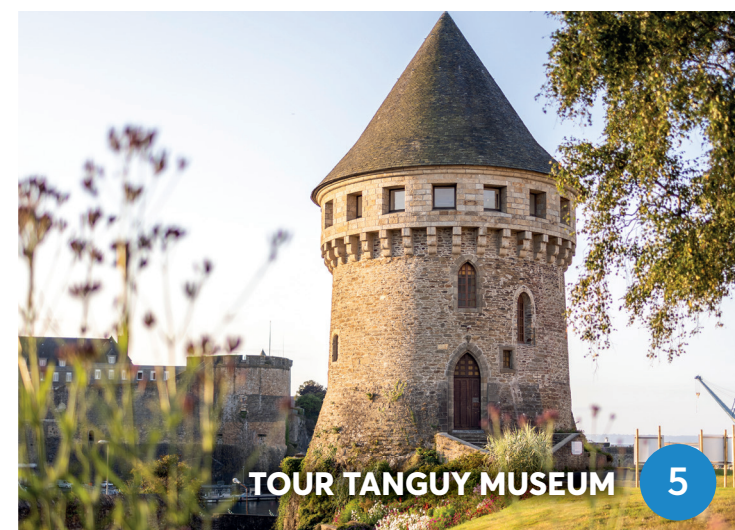
TOUR TANGUY MUSEUM 5