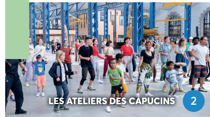
LES ATELIERS DES CAPUCINS 2