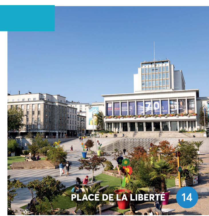
PLACÉ DE LA LIBERTÉ 14