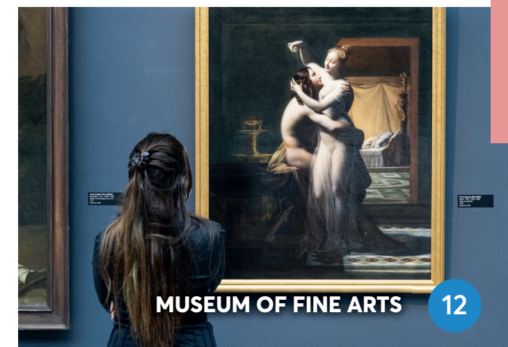
MUSEUM OF FINE ARTS 12