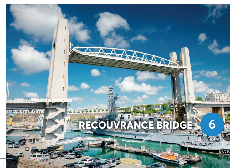
RECOUVRANCE BRIDGE 6