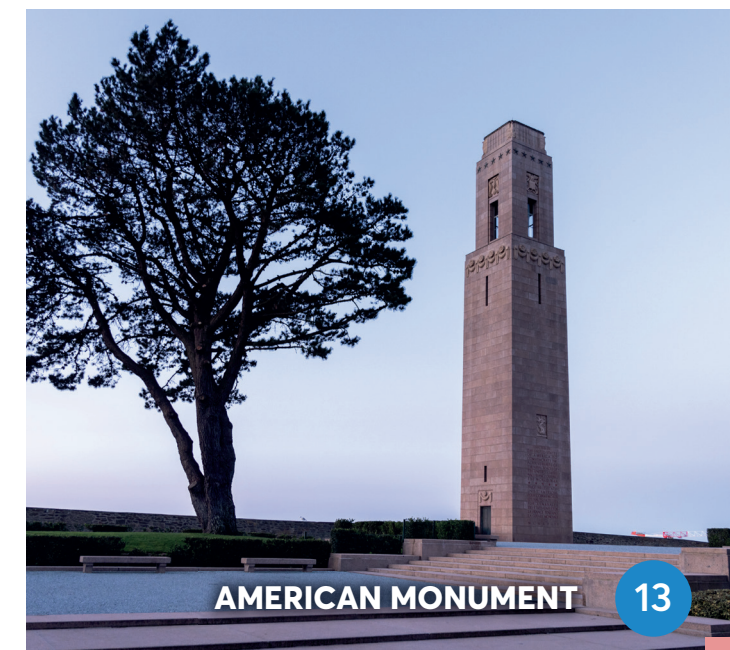
AMERICAN MONUMENT 13