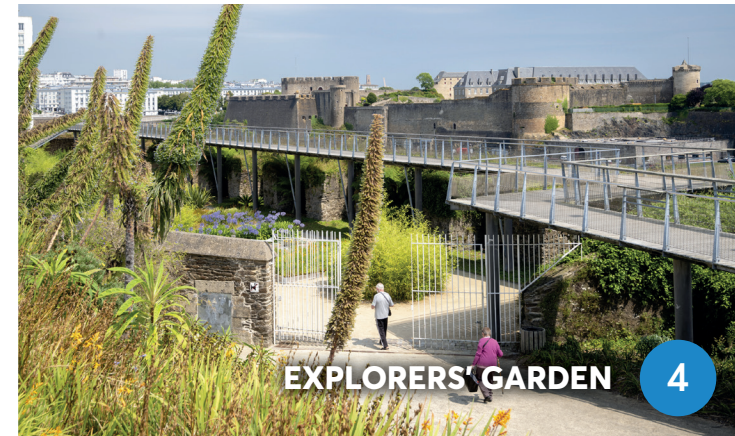
EXPLORERS GARDEN 4