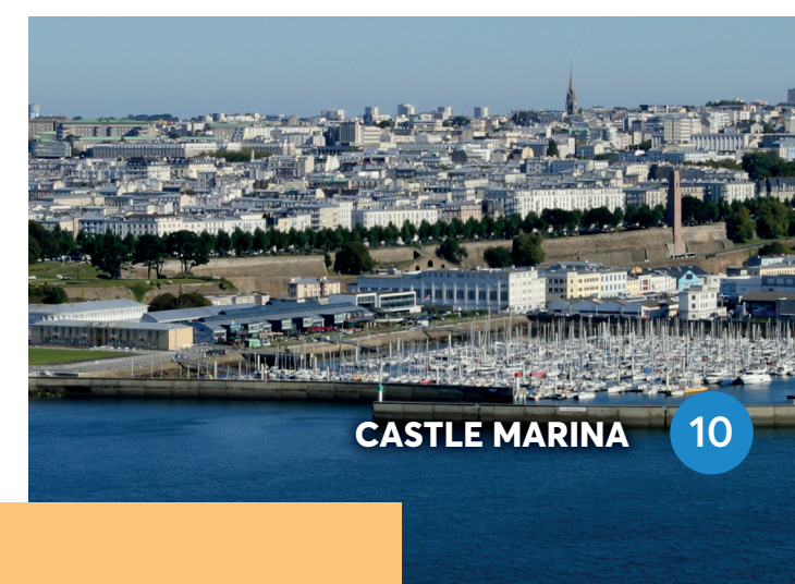
CASTLE MARINA 10