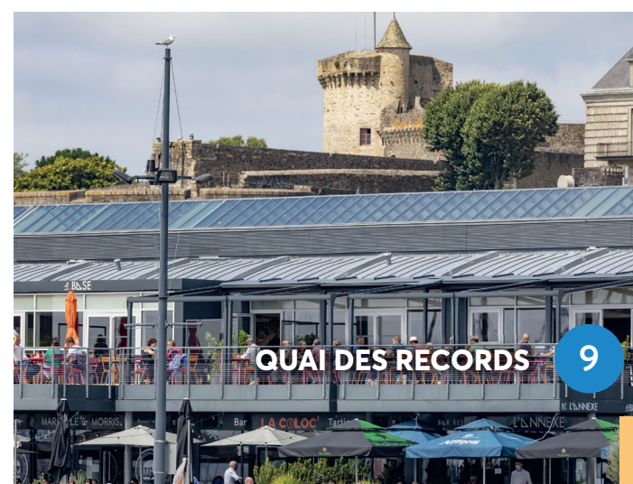
QUAI DES RECORDS 9